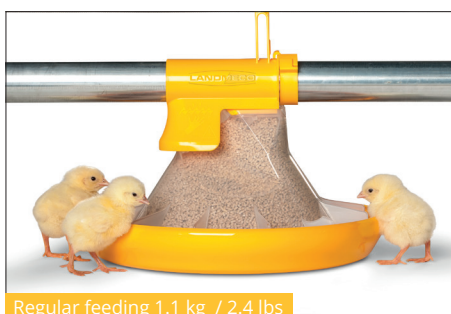
Regular feeding 1.1 kg / 2.4 lbs

The system stimulates the chicks' curiosity and collectively activates them to seek fresh feed. Experiments have thus shown that chick bodyweight is up to 30 g / 1 oz higher than normal after the first week when the kick-off system is used.