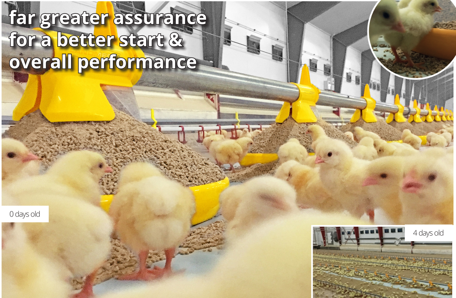
0 days old