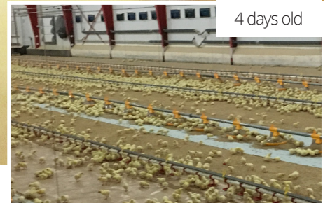
4 days old