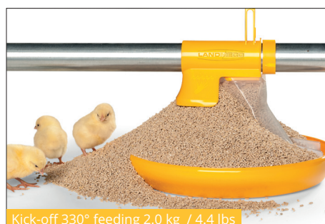
Kick-off 330° feeding 2.0 kg / 4.4 lbs